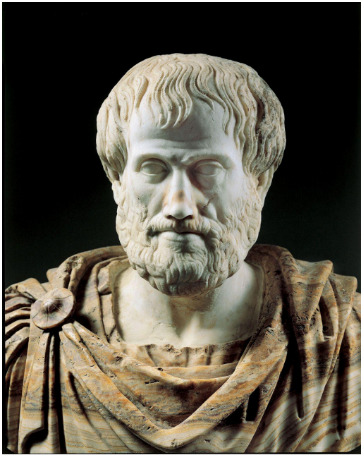
Aristotle Father of Zoology