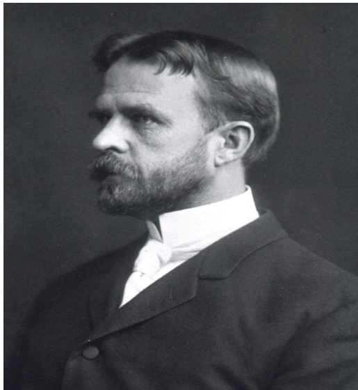
T.H.Morgan Father of Modern Genetics